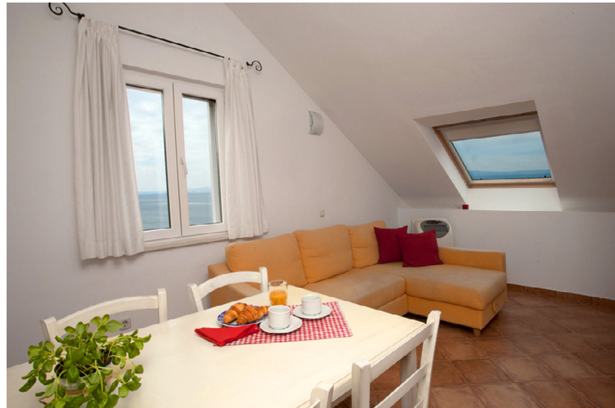
Lovely studio apartment with dining area and couch, which turns into a cosy bed for 1 child